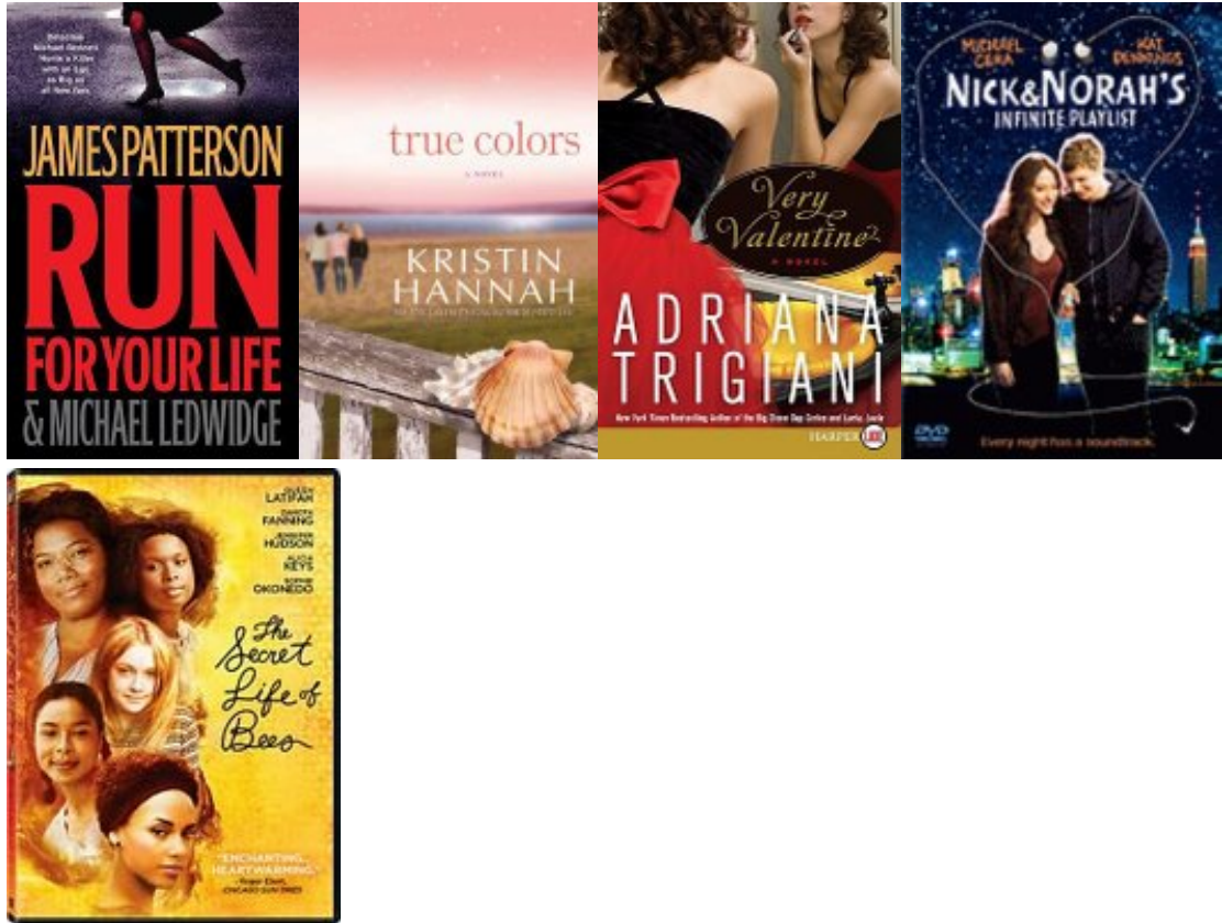
Posted by Brentwood Library at 9:35 AM